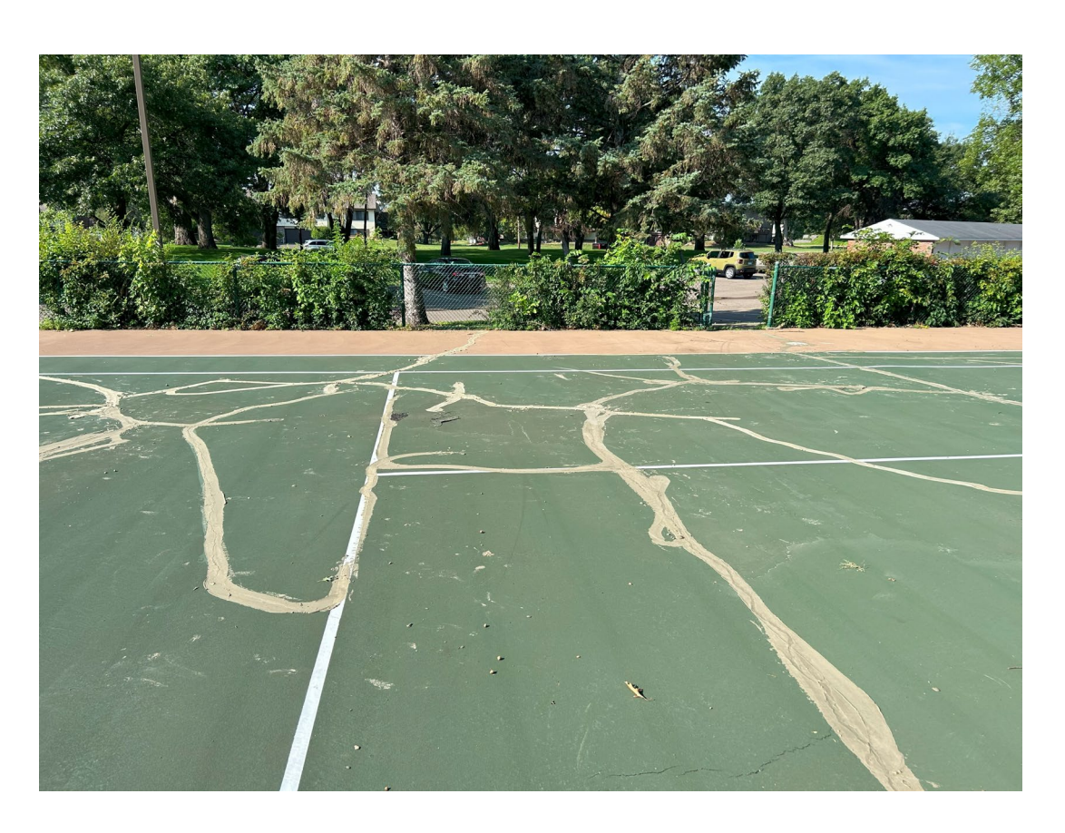
1. Clean Out Cracks